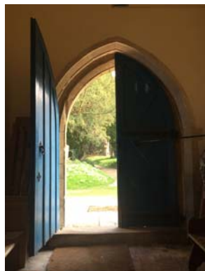
Aston Rowant Church by Louise Heathcote

Methodist Services – Station Road, Chinnor