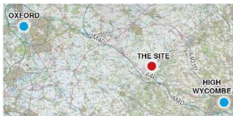
Wider Context Map