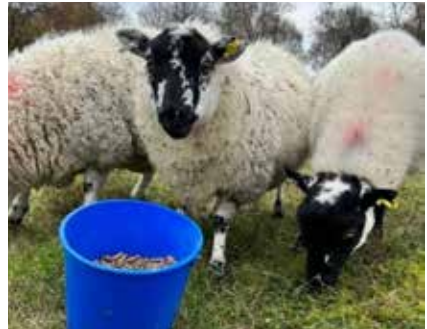
Some of our Beulah lambs