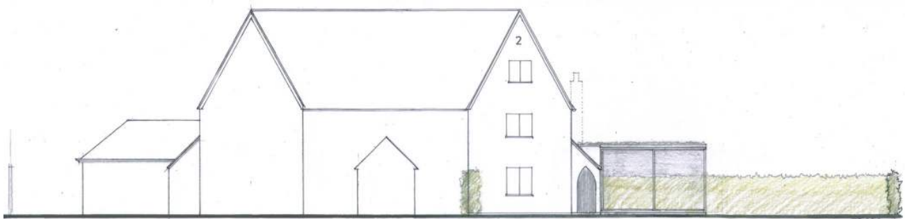
south east (front)